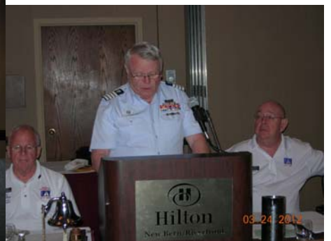
USCG Auxiliary report