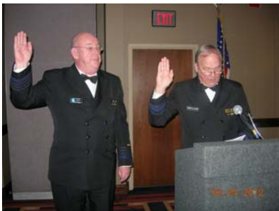
11 Our Leader for 2012-2013