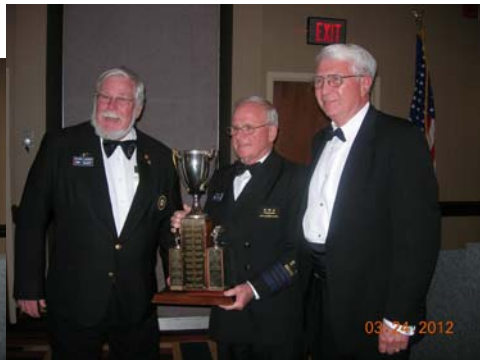
Squadron of the year