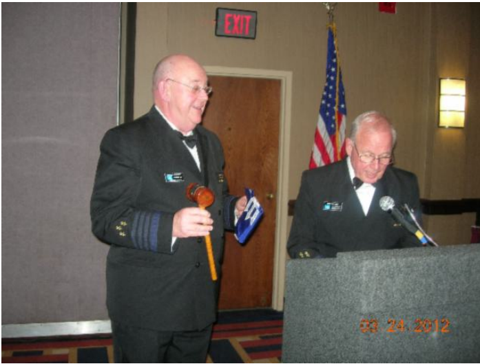
DO NOT LOSE THE D/C FLAG!