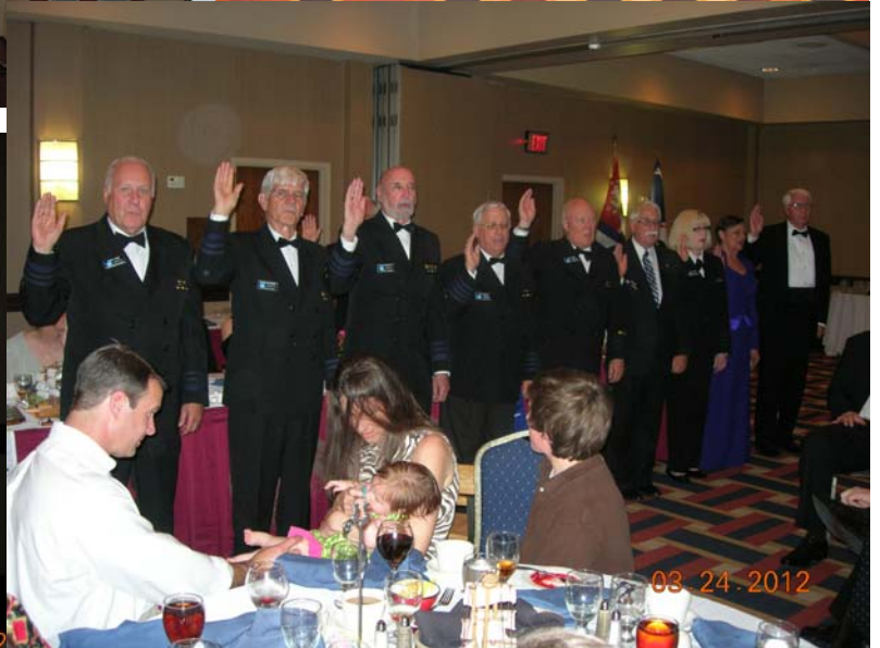
CAN THEY HANDLE IT?