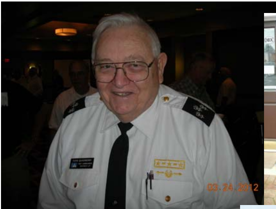
He is back!