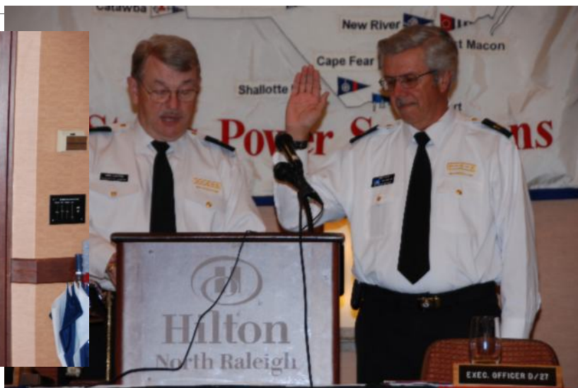
OUR NEW COMMANDER