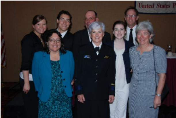
THE LADIES WERE THERE

I am looking forward to working with each of you this year and hopefully, the year will be fun and rewarding.