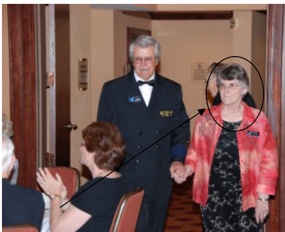
THE POWER BEHIND THE THRONE

Many thanks to those that have served us well. Many thanks for those serving us now, and many thanks for those willing to serve us in the future. The future of safe boating is in you hands; volunteer to help. See you in Cape Charles.